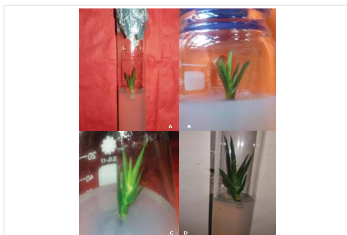
Figure 1: Induction and development of multiple shoot buds in shoot apices of A. vera L. a) Initiation of MSBs formation after 10 days of culture, b) Development of MSBs on MS medium with 2.0 mg/l BAP + 1.0 mg/l IAA, c-d) Elongation of MSBs on MS medium containing 2.0 mg/l BAP + 1.0 mg/l IAA.

d = days, MSBs = Multiple shoot buds. *values are the means of three replicates with 15 explants. Figures in the column having the same letter(s) within a location did not differ significantly according to DMRT \leq 0.05 .