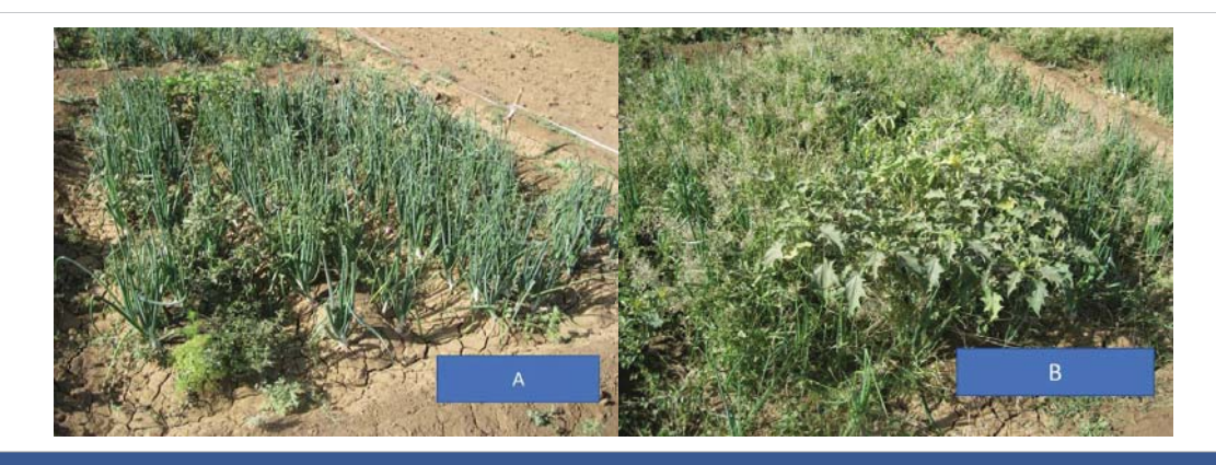
Figure 1: Effect of (A) sequential application of pendimethalin and oxyfluorfen and (B) the Un-weeded Control in direct seeded onion at ten weeks after sowing (WAS).

*: significant at p \le 0.05 ; **: significant at p \le 0.01 ; ***: significant at p \le 0.001 ; ns: non-significant; RD: Recommended Dose; LD: Lower Dose; se: Standard Error.