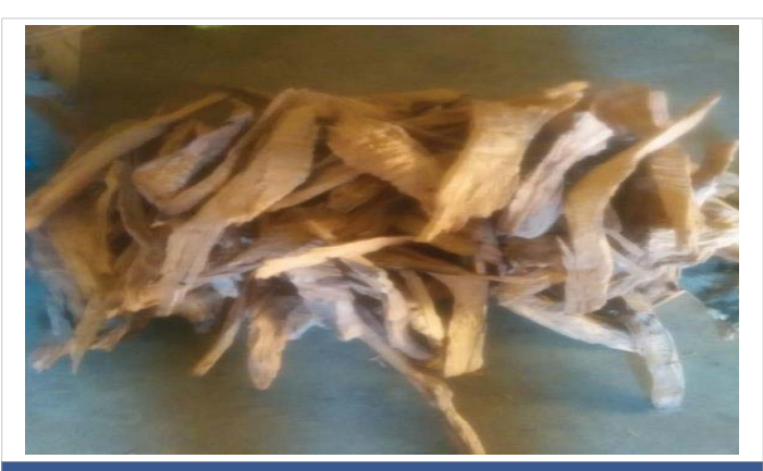
Figure 1: Dry pieces of Olea europaea stem

The chemical properties of Essential Oils have been identified by comparing their MS with the reference spectra at the National Institute of Standards and Technology (NIST)