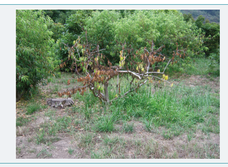
Image 1: Dead peach tree in conventional hole, fully girdled by Armillaria mellea . Healthy peaches in the background. Note old stump (left of dyeing peach) of Avocado that had previously died of Armillaria serving as inoculum source.

Table 1: Percent Survival from Armillaria infection.