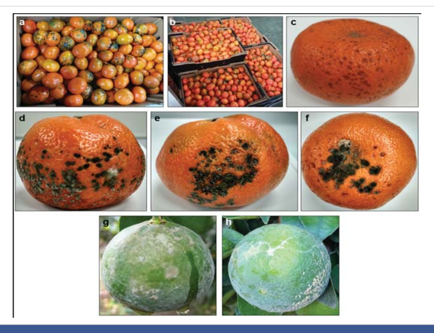
Figure 1: Representative images of fruit diseased by Cladosporium ramotenellum sooty spot. Boxes of W. Murcott mandarins affected after 15 to 22 days of cold transportation from Perú to USA (a-b). Details of W. Murcott mandarin diseased, showing the initial pitting (c), and fruits where some of the spots have developed aerial mycelium (d-f). Green immature W. Murcott mandarins before being collected to analyse the presence of Cladosporium sp. in the field (g-h).

Cladosporium species are broadly distributed and can be found on many types of substrates (plants, soil, food, organic matter, etc.) [2]. Recent phylogenetic studies recognised more than 170 Cladosporium species, belonging to three species complexes: the herbarum complex, the cladosporioides complex, and the sphaerospermum complex [2]. Cladosporium spp. can infect citrus fruit when spores are deposited onto weakened areas of the rind and germinate in storage conditions of high relative humidity. The fungus can grow at low temperatures of close to 0°C. The decay affects mainly the rind, producing firm but flexible areas that become dark. Later, a gray-olivaceous or black mycelial growth may cover the black spots [3]. In citrus, the Cladosporium species associated with decay have been C. herbarum [4] and C. cladosporioides [1,3]. However, Cladosporium sp. is not a common citrus pathogen. The frequency of natural infections caused by this fungus is very low and affects mainly to fruits with injuries and rind disorders, as the infection of the fruit starts through fissures or cracks in the rind [3].